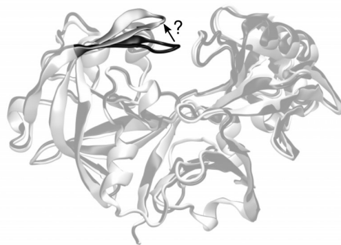
Renin: closed (black) vs. open (grey) flap